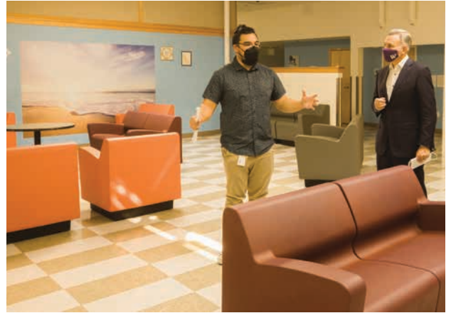
The living room space at King County's single crisis center.

King County is charting a path forward to create a regional network of crisis care centers, preserve and increase residential treatment beds, and invest in a robust behavioral health workforce. Together, these efforts will increase public well-being and safety, and give families, first responders, and crisis response teams better places to take people than jails and emergency rooms.