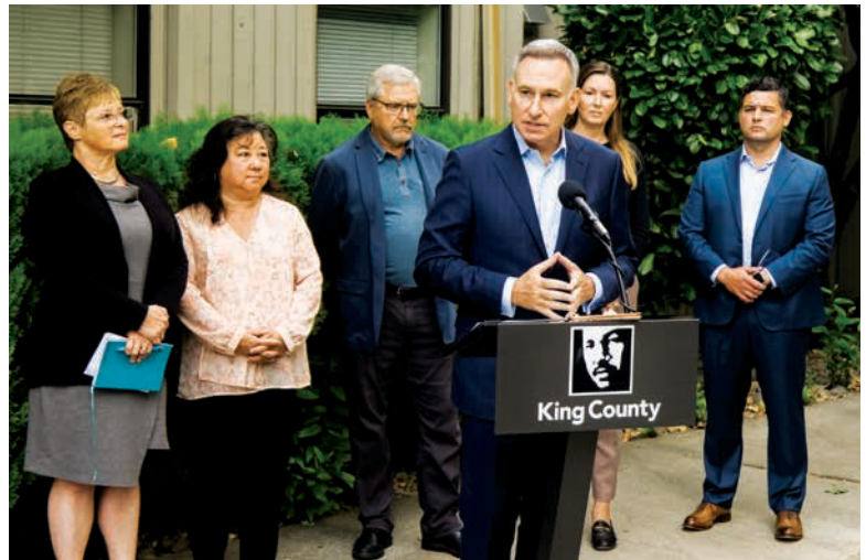
King County Executive Dow Constantine announces the final stage of purchasing Cascade Hall, a 64-bed residential treatment center in north Seattle on September 14.