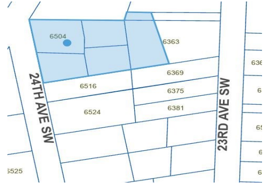
The top of this image is north. This map is for illustrative purposes only. In the event of omissions, errors or differences, the documents in Seattle DCI's files will control.

Land Use Application to allow 5, 2-story single family residences, 3 attached accessory dwelling units, and 3 detached accessory dwelling units. Parking for 11 vehicles proposed. Existing structures to be demolished.