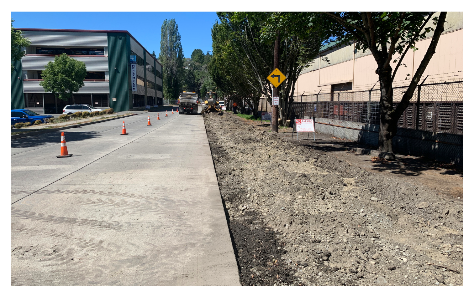
Paving work from last week on SW Andover Street