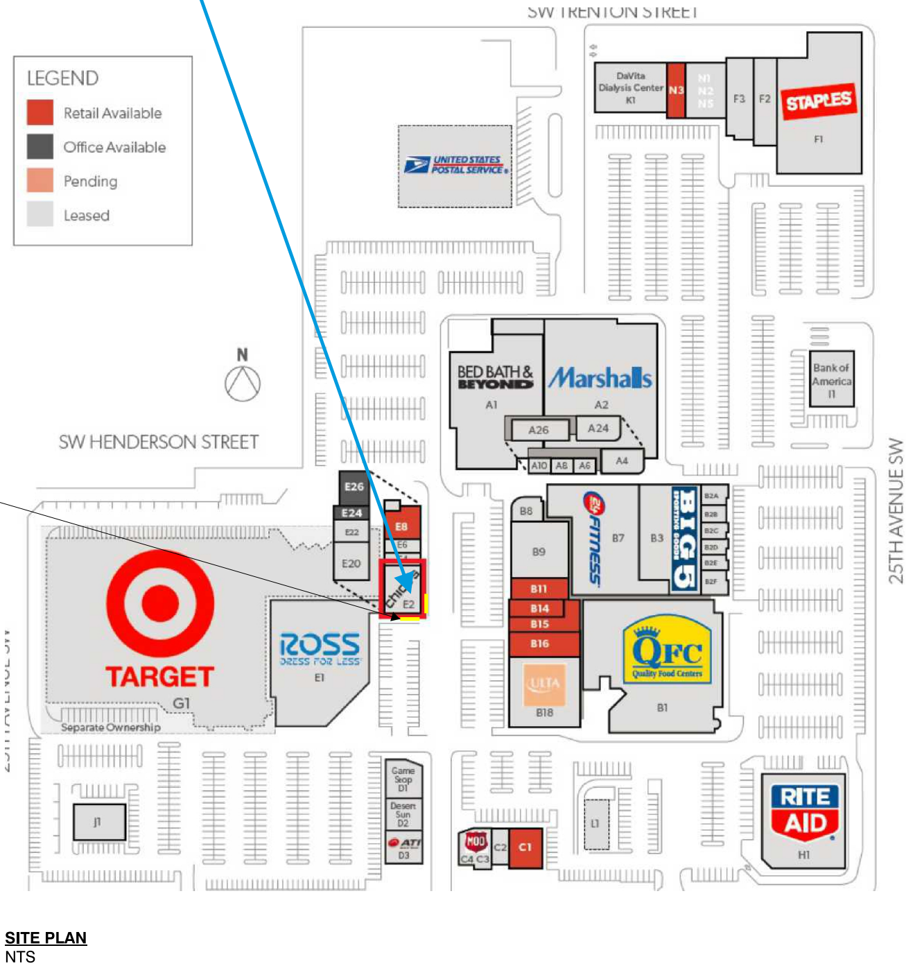
SITE PLAN NTS