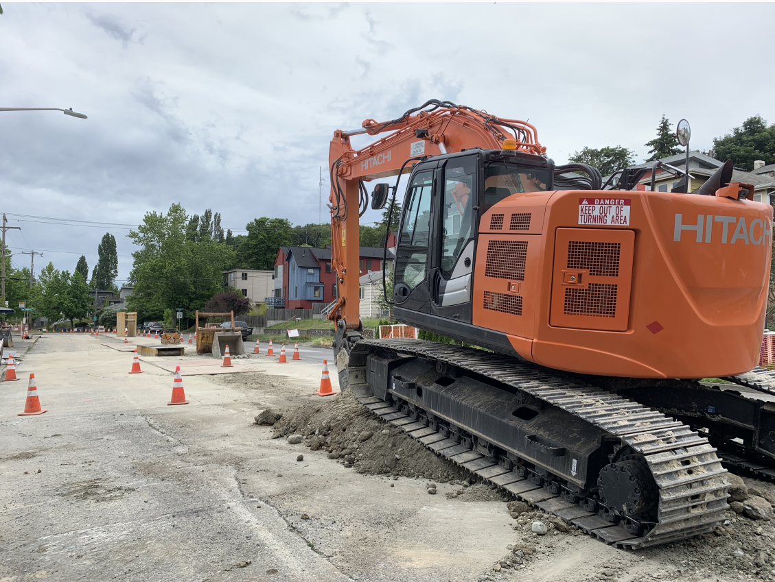
As part of this project, we will be upgrading the road condition throughout the corridor. You can expect roadway demolition to look like the photo above.