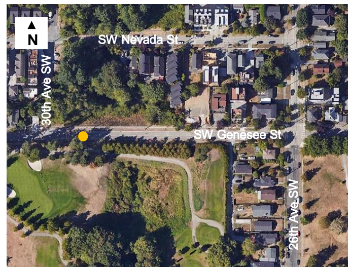
● Approximate boring location