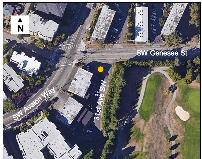
● Approximate boring location

The West Seattle and Ballard Link Extensions project is part of the voter-approved Sound Transit 3 Plan (ST3) to expand the regional mass transit system. When complete in 2030 (West Seattle) and 2035 (Ballard), these extensions will provide fast, reliable light rail connections to dense residential and job centers throughout the region.