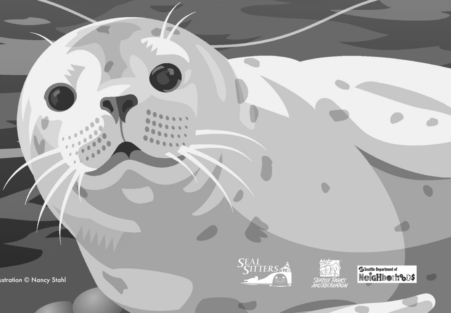
Illustration © Nancy Stahl