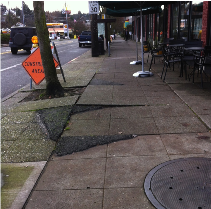
California Ave at Fauntleroy