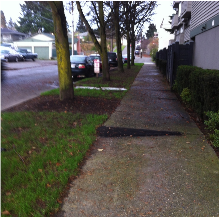
SW Graham at California