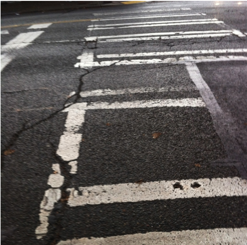
Ruts: California at Graham