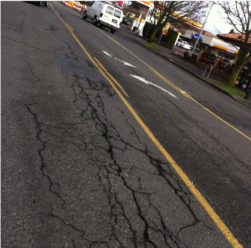
California Ave at SW Holly