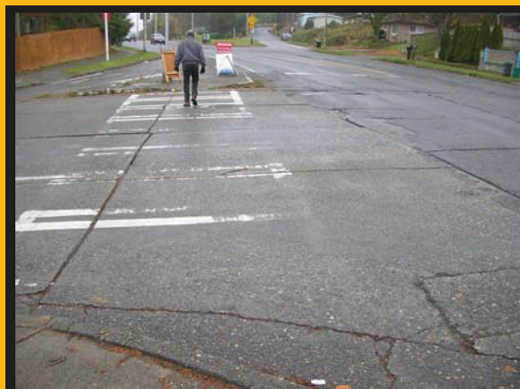
Pedestrian crossing at Delridge Way SW and SW Holden Street