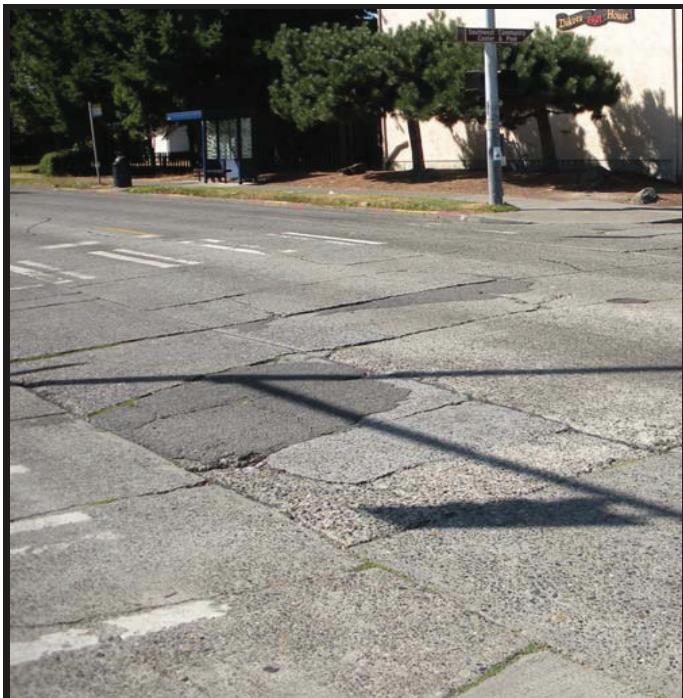
Intersection of Delridge Way SW and SW Thistle Street