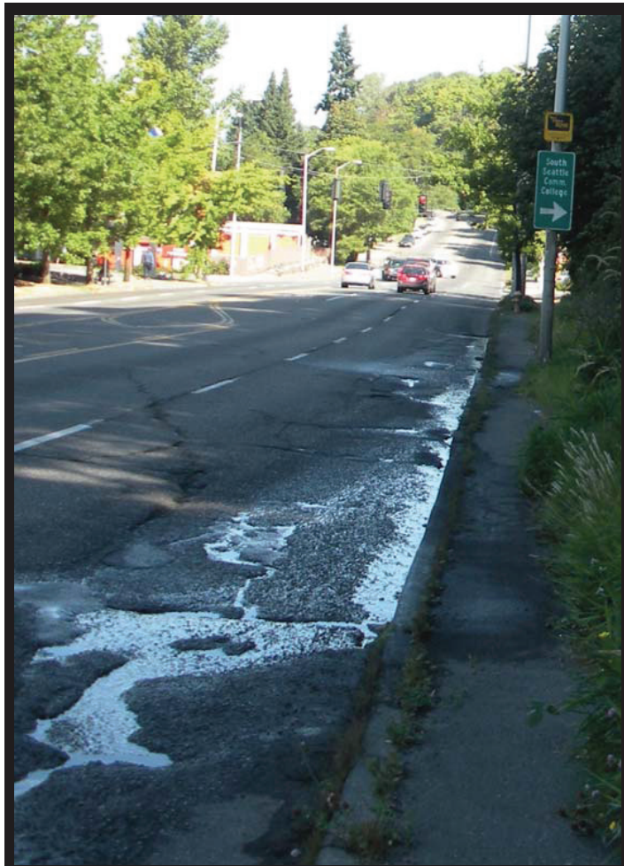
Looking north toward intersection of Delridge Way SW & SW Orchard Street.

The project budget includes paving approximately one mile of Delridge Way SW, from SW Henderson St to SW Orchard St. The project may also include Delridge Way SW and 16th Avenue SW, both between SW Henderson St and SW Roxbury St. These added segments depend on the results of construction bids - lower bids mean funds can be stretched further - as well as potential savings from other projects wrapping up this fall that might be applied to this project.