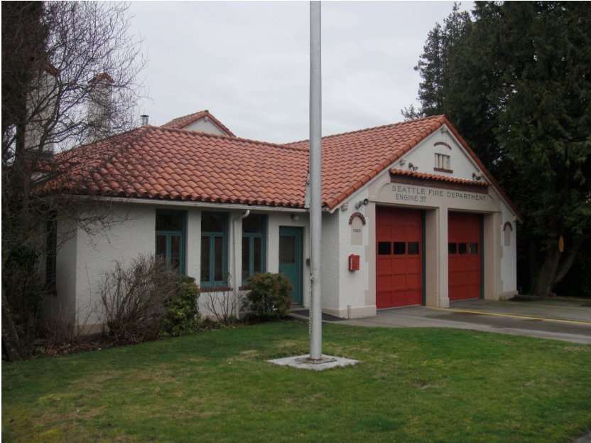
Fire Station No. 37 looking southeast from the corner of SW Othello St. and 35th Avenue SW

Fire Facilities Levy Program: http://www.cityofseattle.net/fleetsfacilities/firelevy/default.htm Landmarks Nomination Report, Parts 1 and 2: http://www.seattle.gov/fleetsfacilities/firelevy/facilities/fs37/pdfs/BOLASF37NomPart1.pdf and http://www.seattle.gov/fleetsfacilities/firelevy/facilities/fs37/pdfs/BOLASF37NomPart2.pdf . Landmark Controls and Incentives, see Ordinance No. 122467: http://clerk.ci.seattle.wa.us/~public/CBOR1.htm .