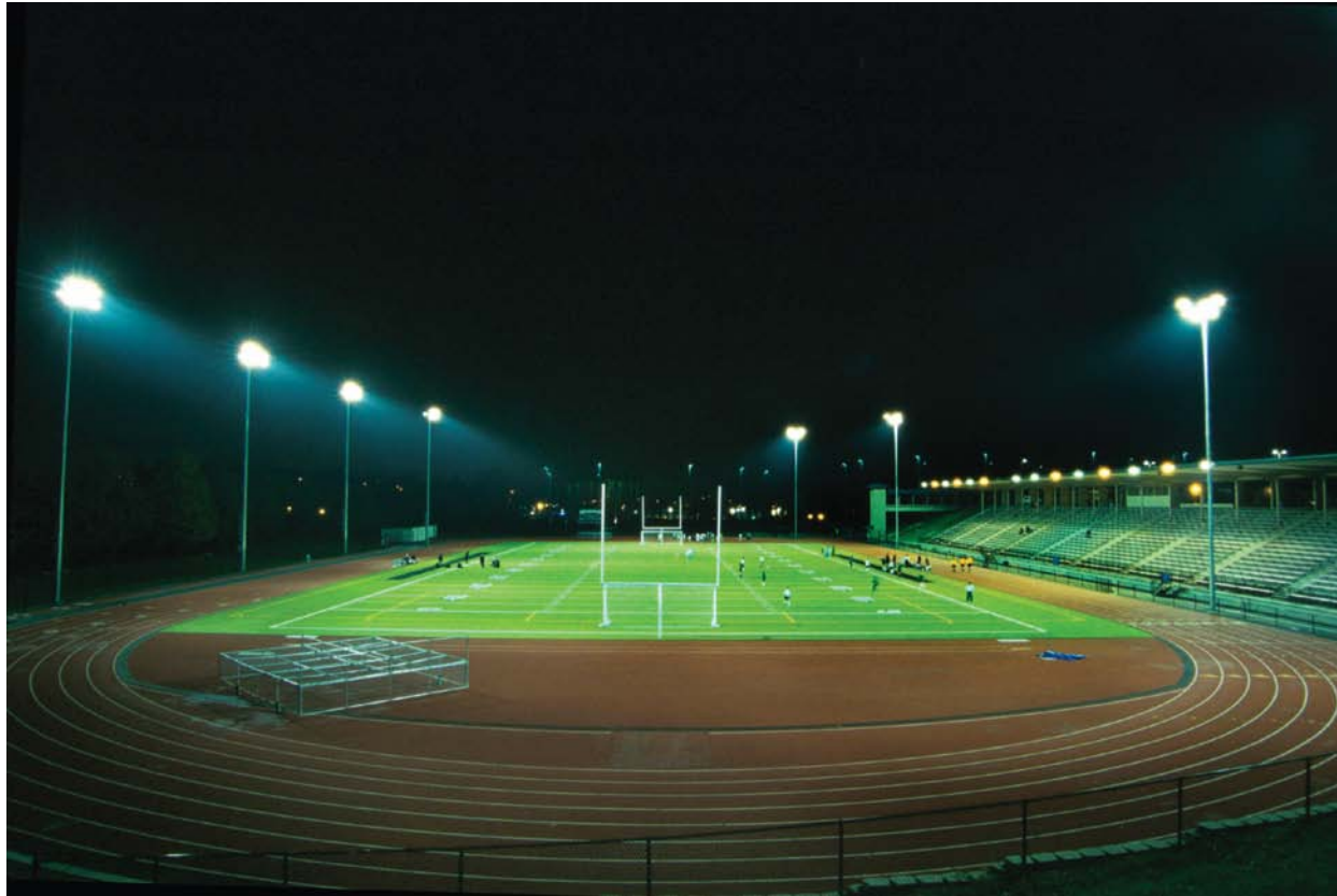
Image: The sports turf and lights were replaced at Chief Sealth's sports facility, improving safety on the field and extending usage