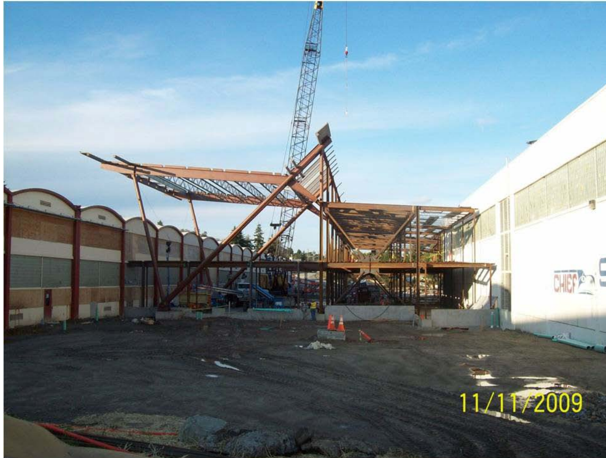
Image: Galleria structural steel erection underway, November 2009