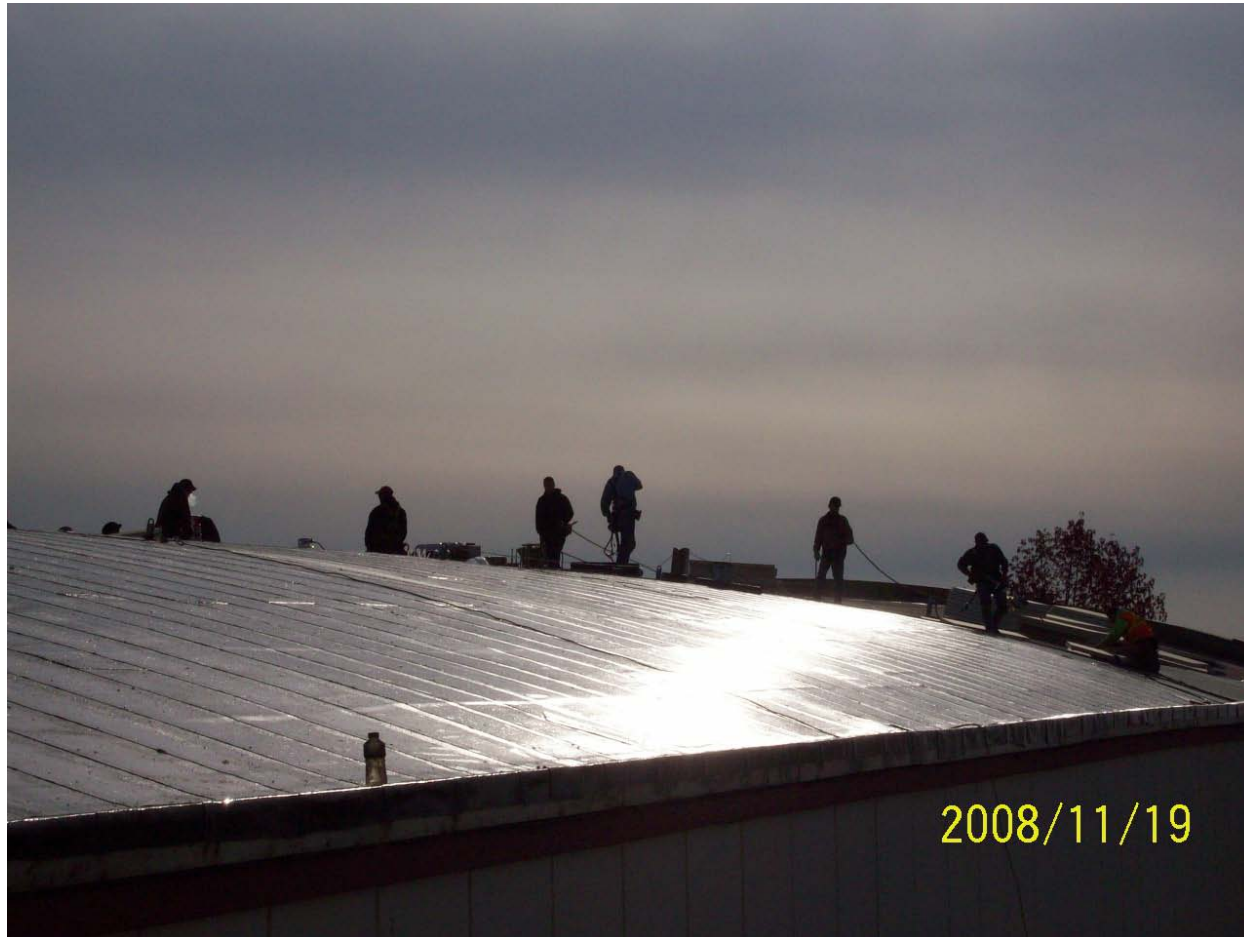
Image: New roofing on Auditorium Prospective Student Open House