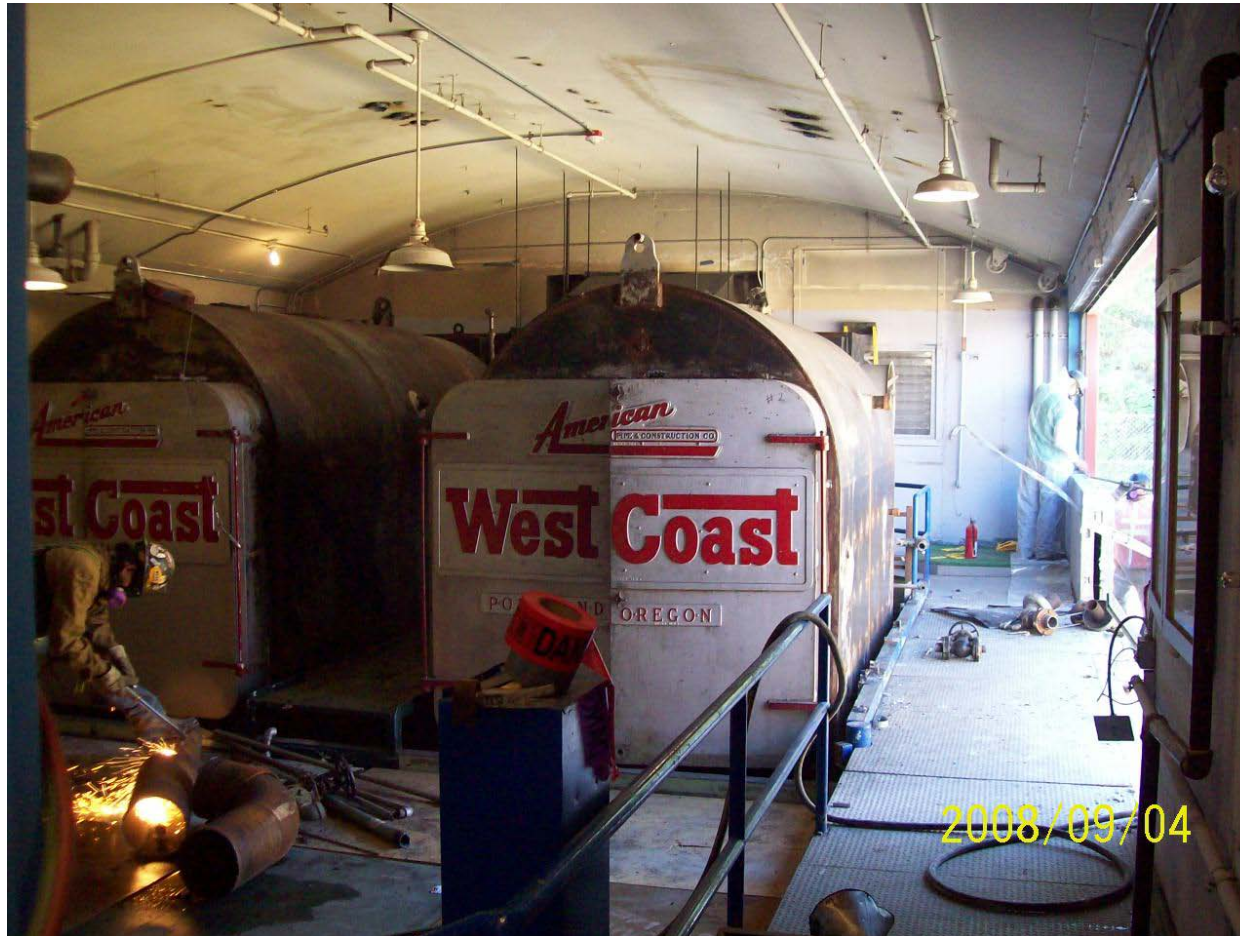
Image: Old boilers removed Prospective Student Open House