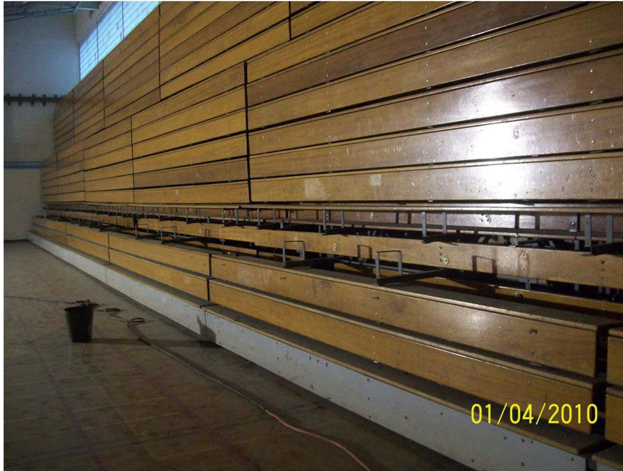
Image: Beginning of bleacher demolition in Gymnasium. Portions of the wood will be reused in the modernization project.