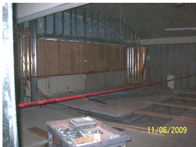
Image: Kitchen area converted into classroom and looking into Commons Prospective Student Open House