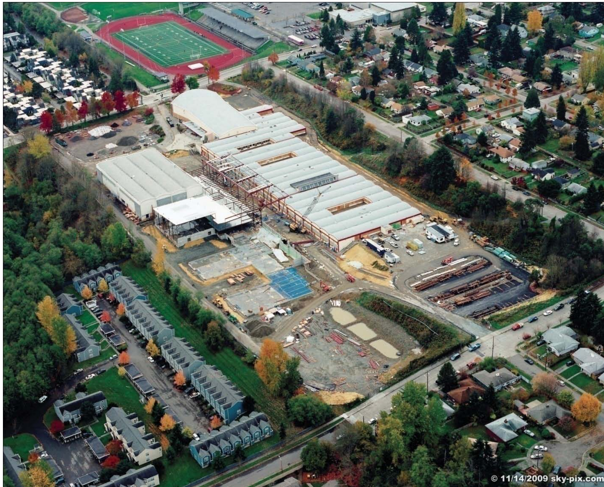
Image: Aerial view of Chief Sealth High School & Denny International Middle School construction site, taken November 15 th , 2009.