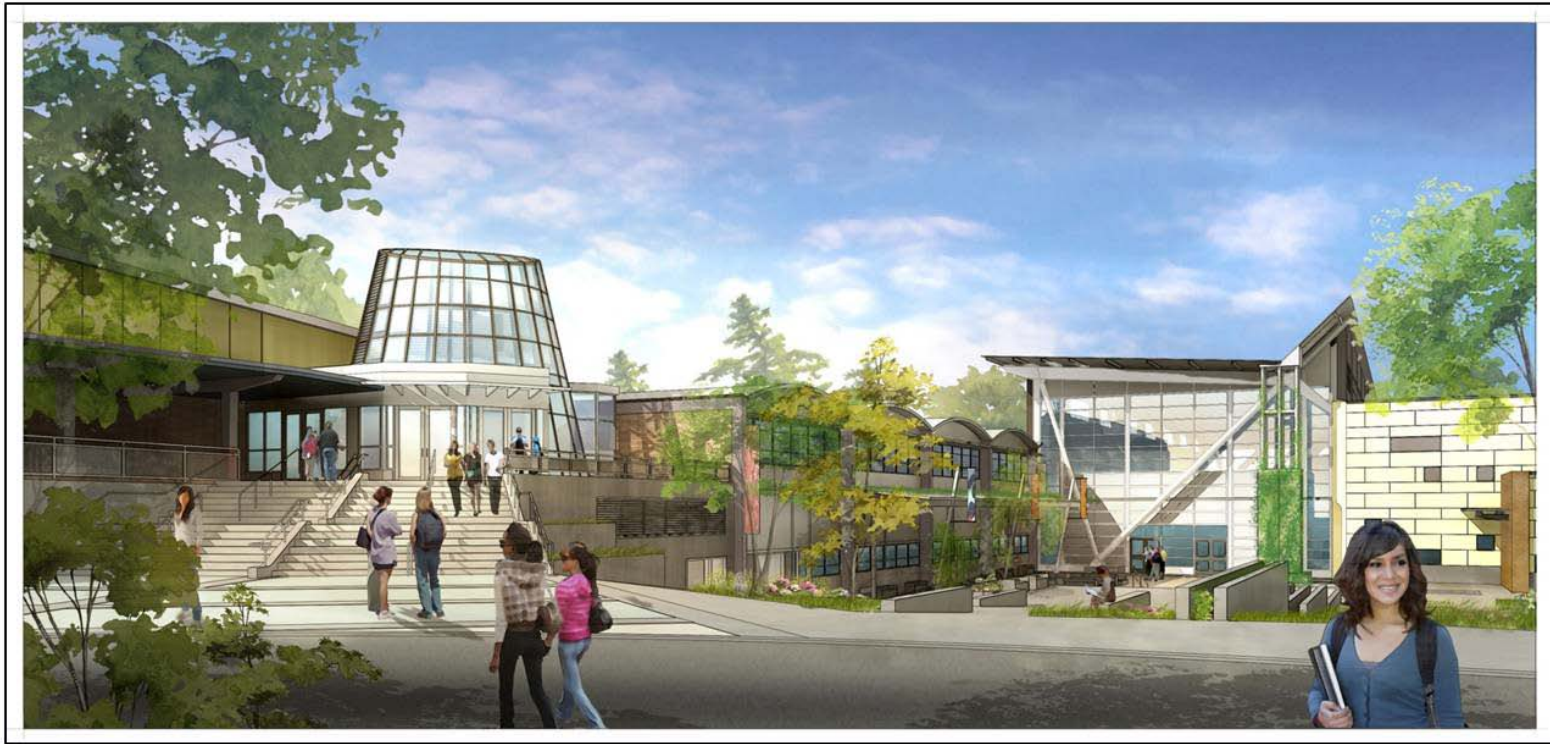
Image: Rendering showing the new plaza entrance to Chief Sealth High School and new Galleria. Prospective Student Open House