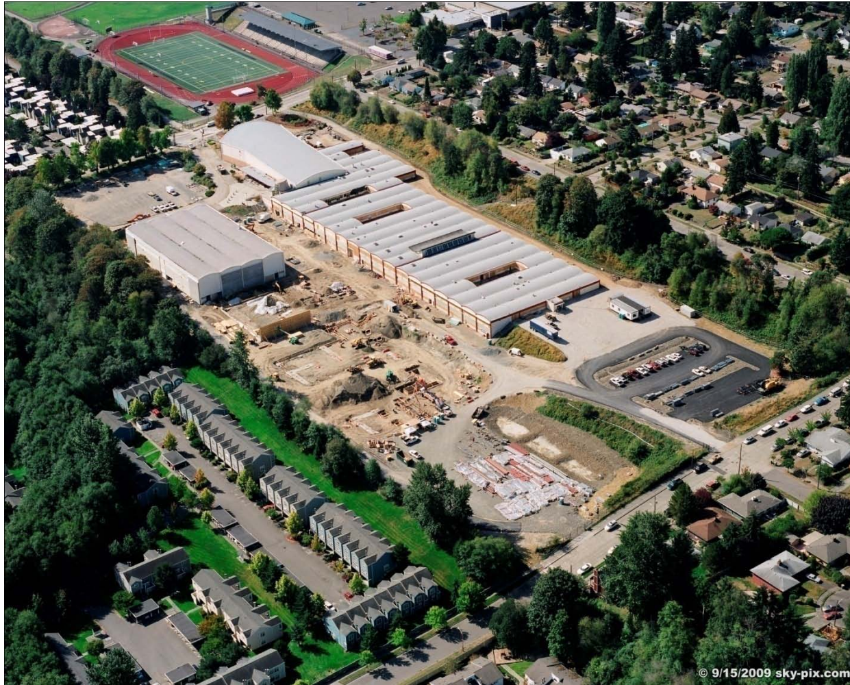
Image: Aerial view of Chief Sealth High School & Denny International Middle School construction site, taken September 15 th , 2009.