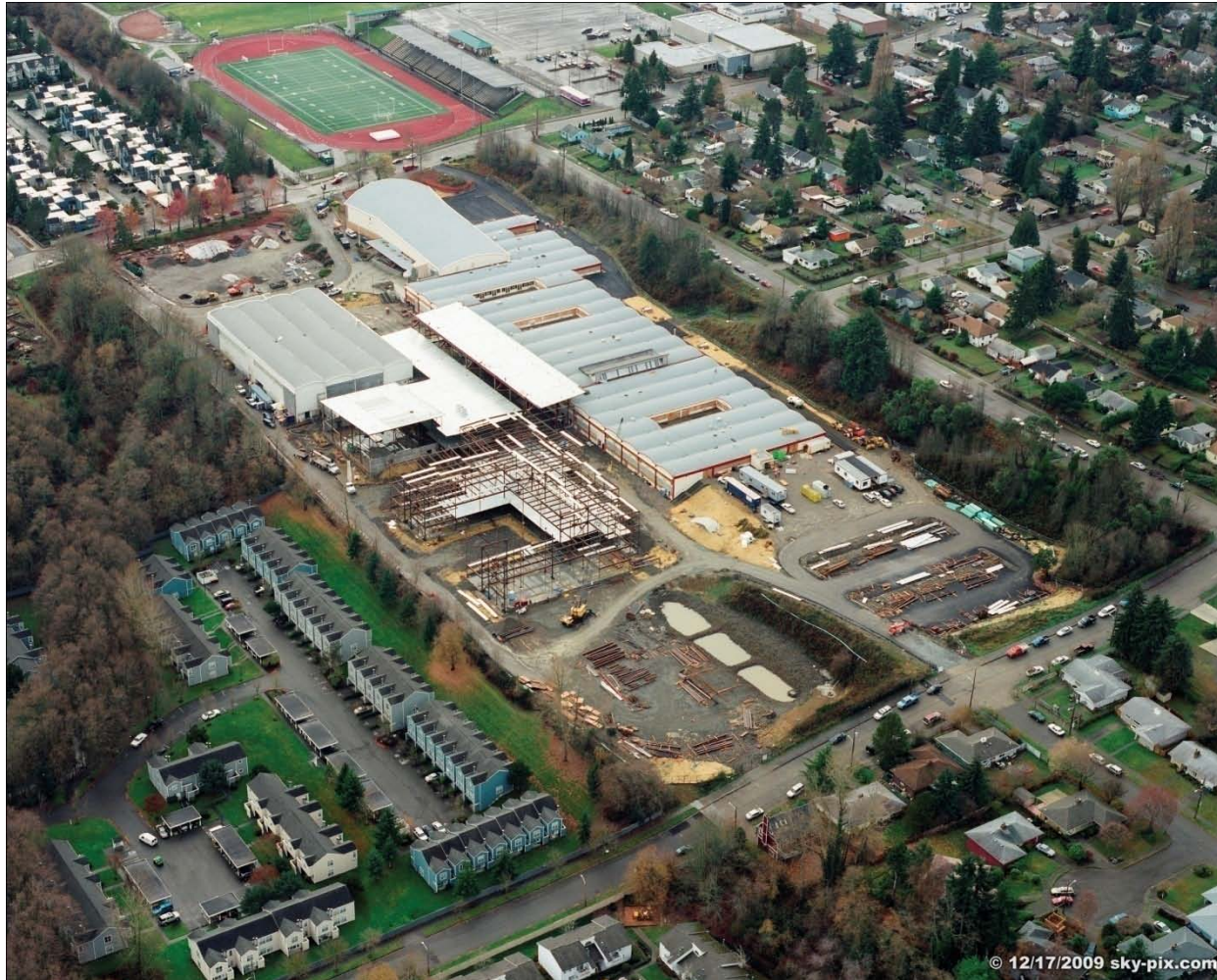
Image: Aerial view of Chief Sealth High School & Denny International Middle School construction site, taken December 15 th , 2009.