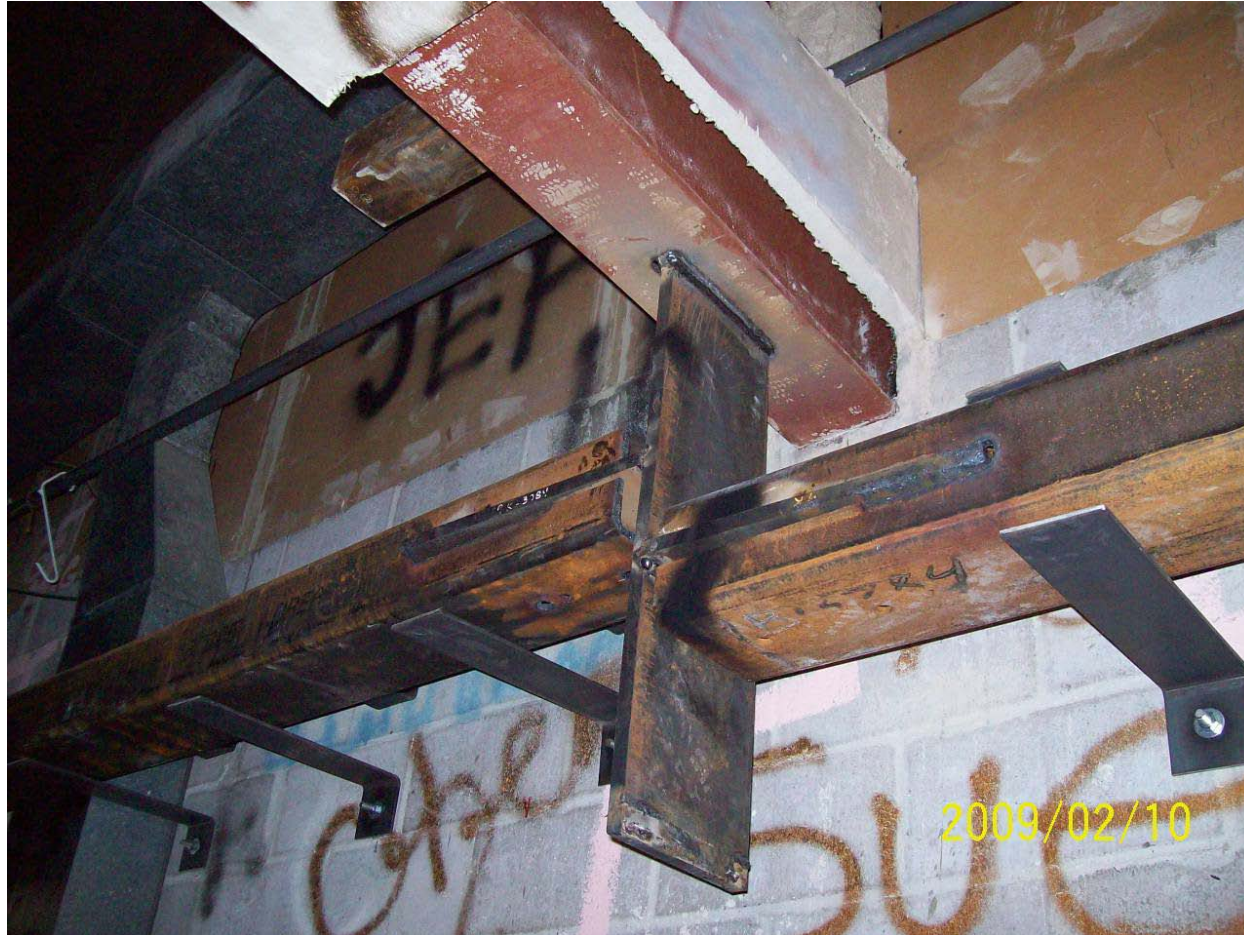
Image: Seismic (earthquake) upgrade – backstage in Auditorium Prospective Student Open House