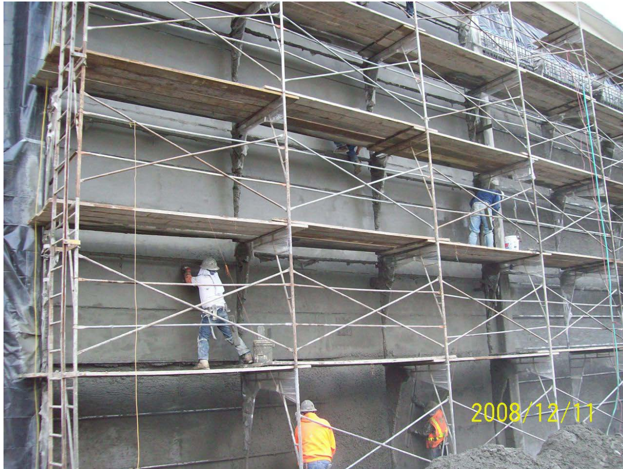
Image: Seismic (earthquake) shear wall on Gymnasium Prospective Student Open House