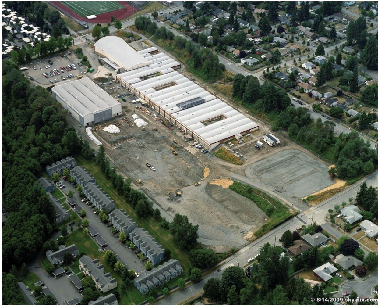
Image: Aerial view of Chief Sealth High School & Denny International Middle School construction site, taken August 14 th , 2009.