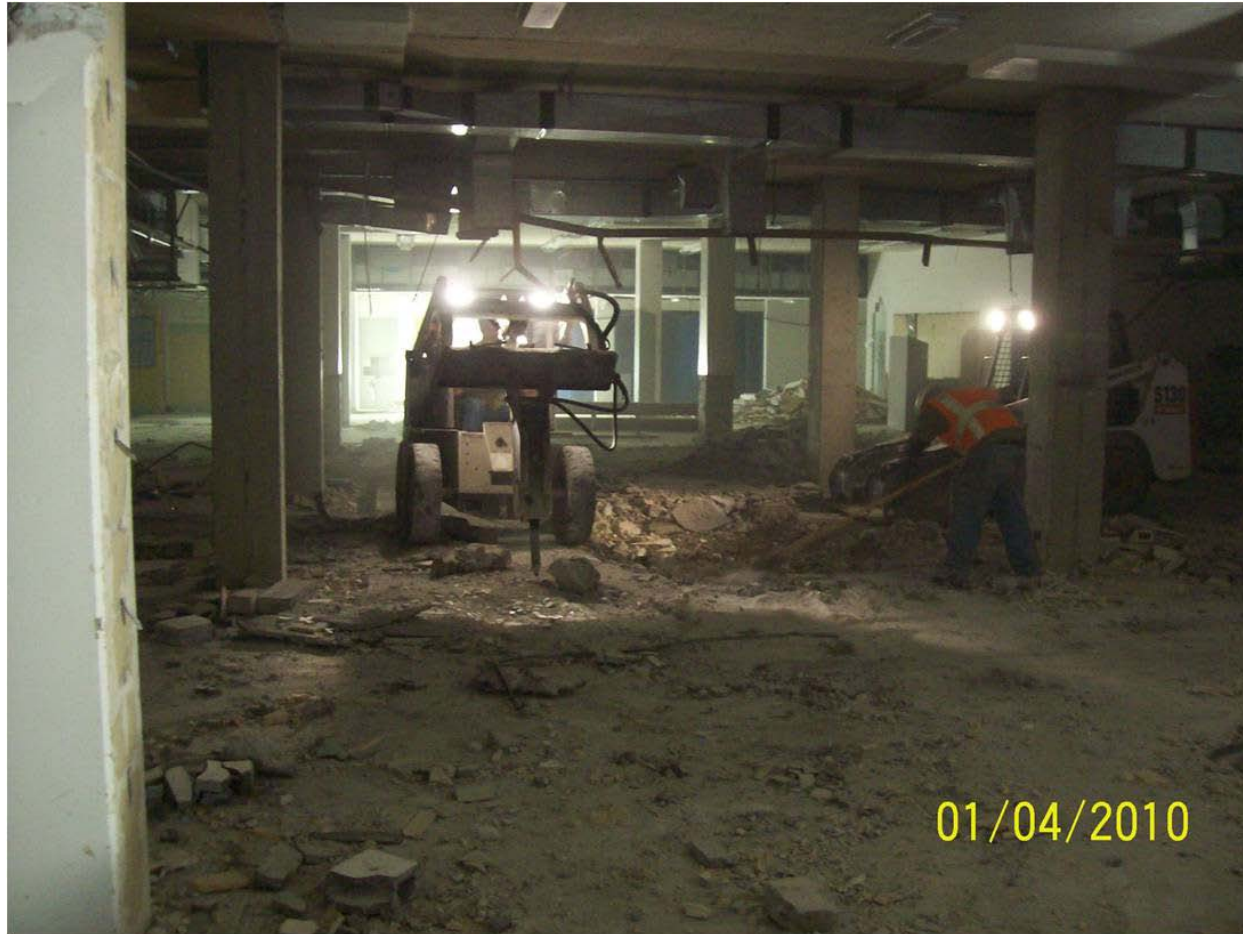
Image: Demolition of Chief Sealth Gymnasium locker rooms Prospective Student Open House