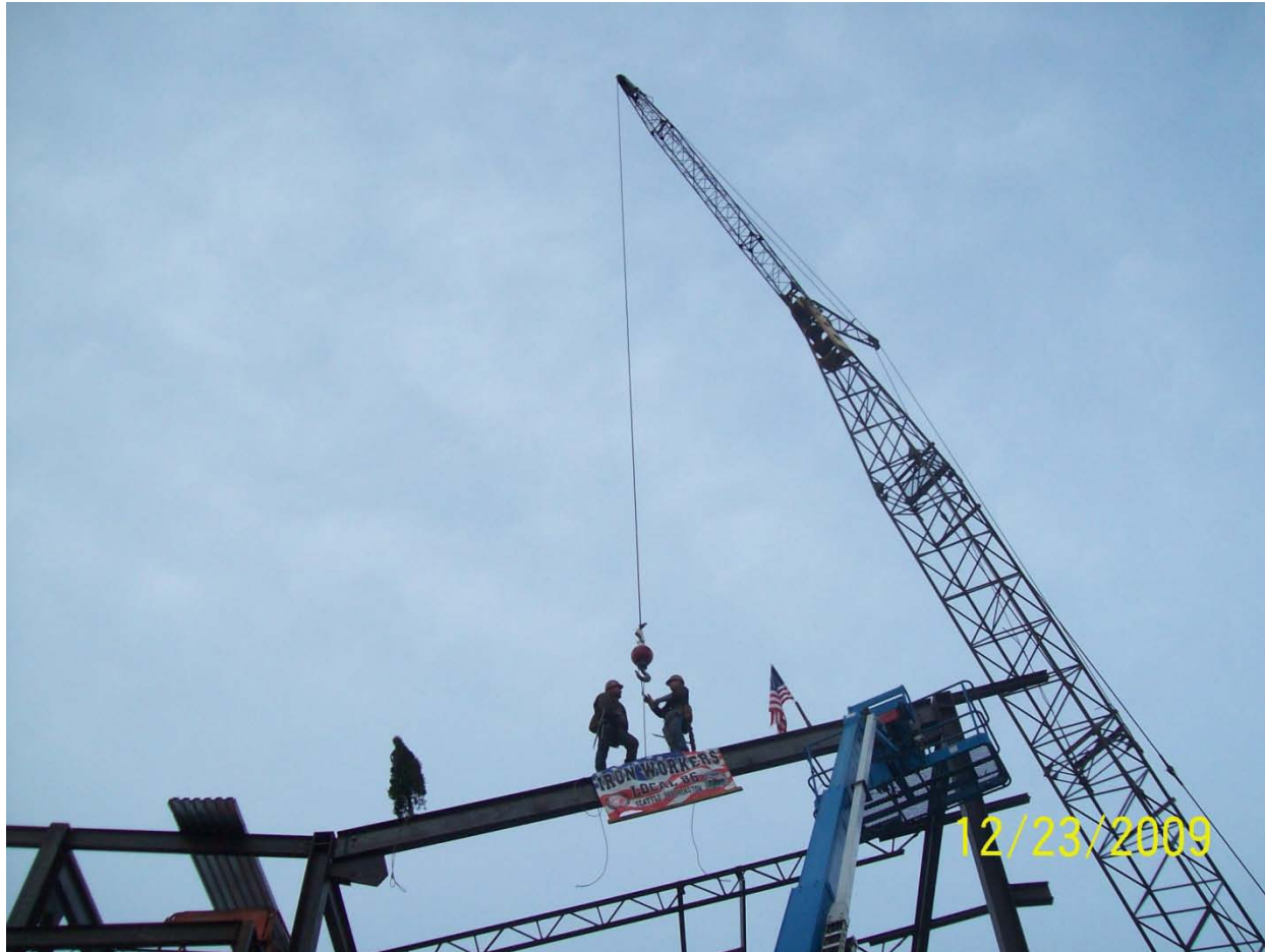
Image: Topping Off of Denny structure, completing the steel structural work for the new Galleria and the Denny School, December 23 rd , 2009.