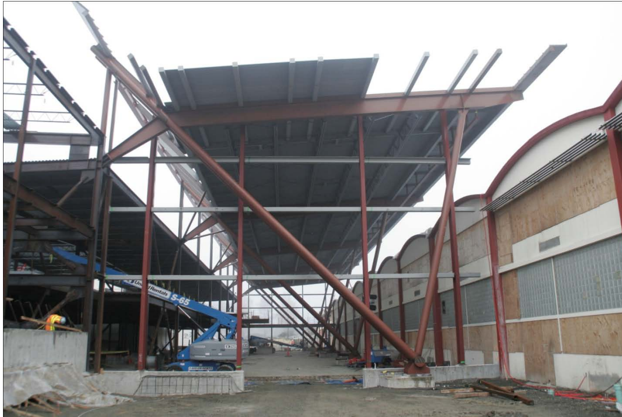
Image: Galleria structural steel erection underway, December 2009