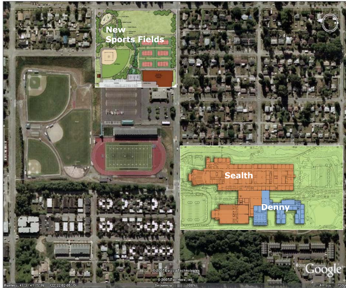
Image: Map showing overlay of new Sports Field and new Co-located Chief Sealth/Denny School.