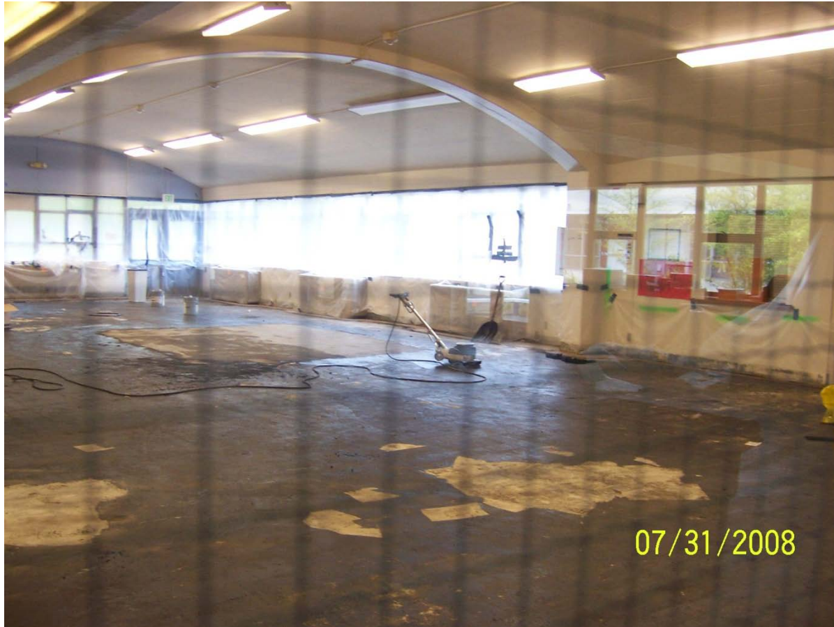
Image: Demolition work begins in Chief Sealth High School Prospective Student Open House