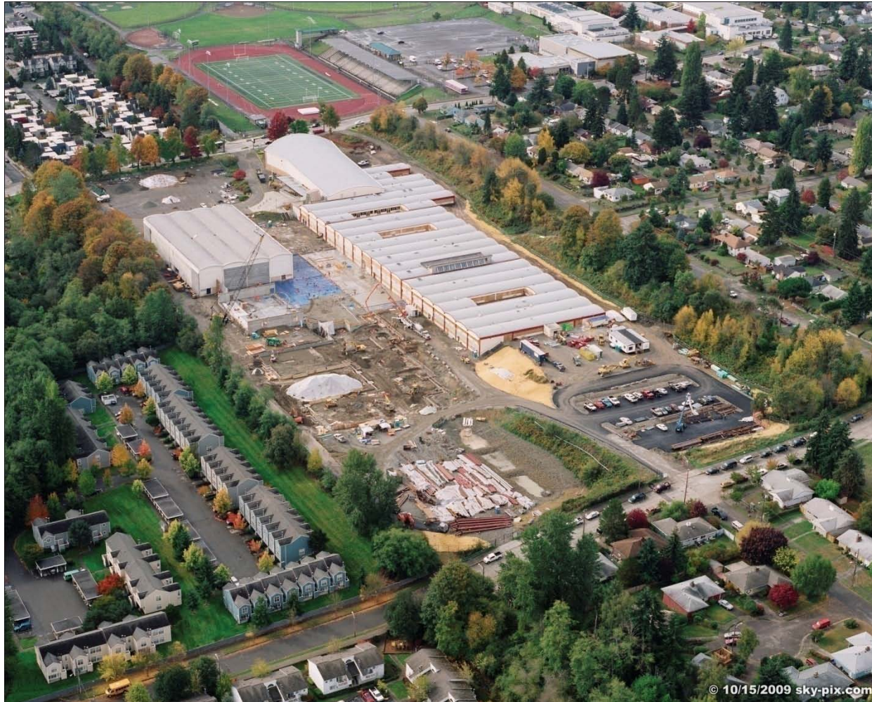
Image: Aerial view of Chief Sealth High School & Denny International Middle School construction site, taken October 15 th , 2009.