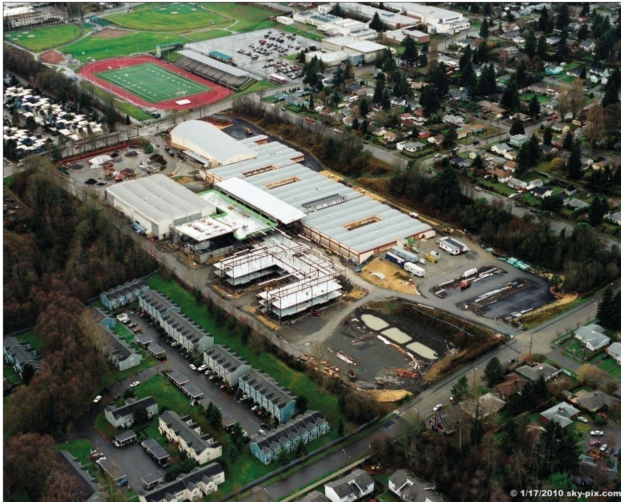
Image: Aerial view of Chief Sealth High School & Denny International Middle School construction site, taken January 17 th , 2010.