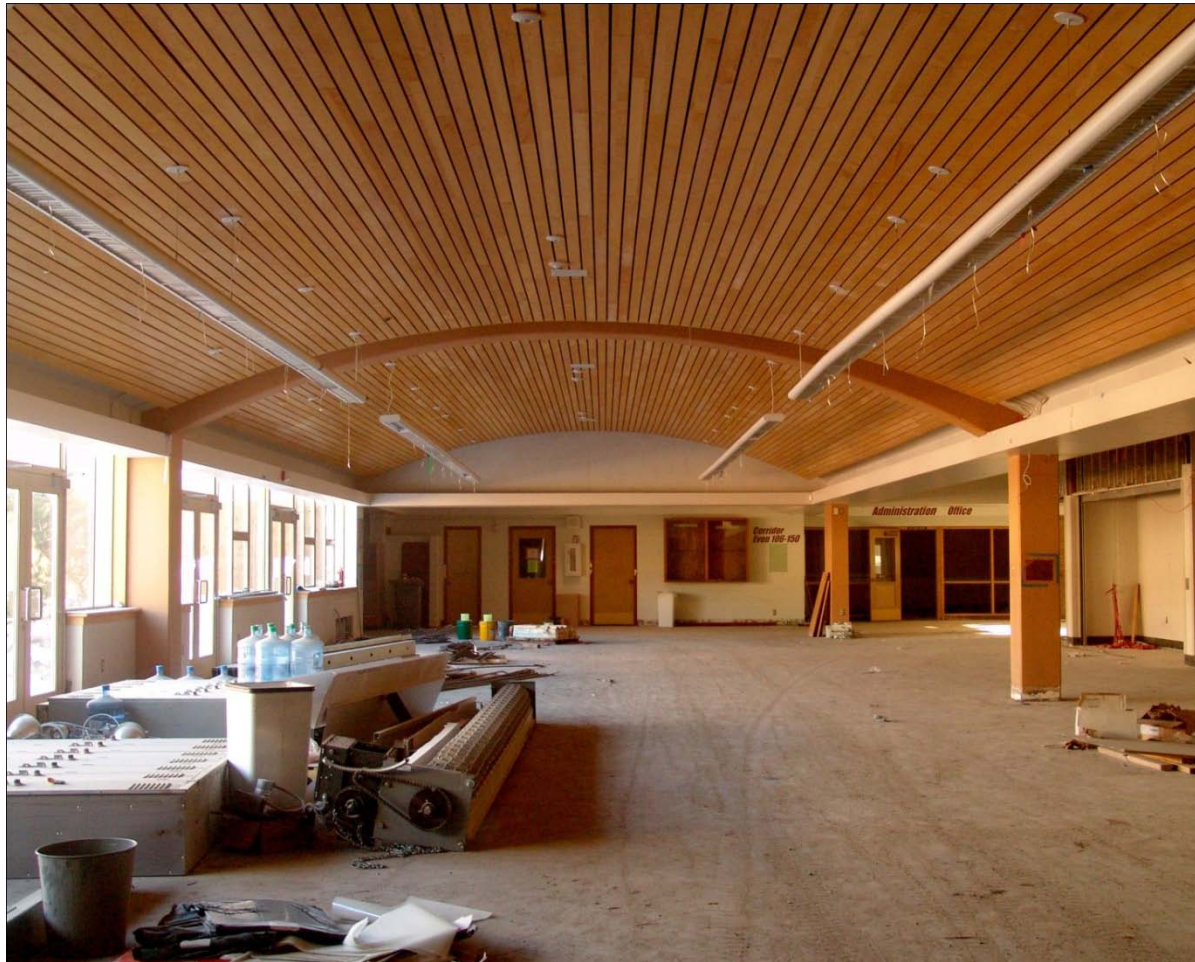
Image: Demolition work begins in Chief Sealth High School Prospective Student Open House