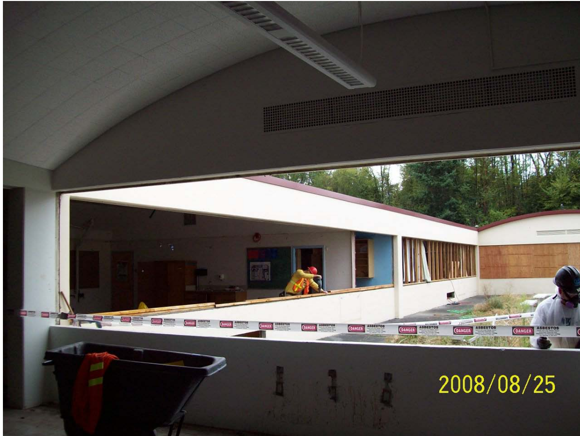
Image: Demolition work begins in Chief Sealth High School – removal of old windows