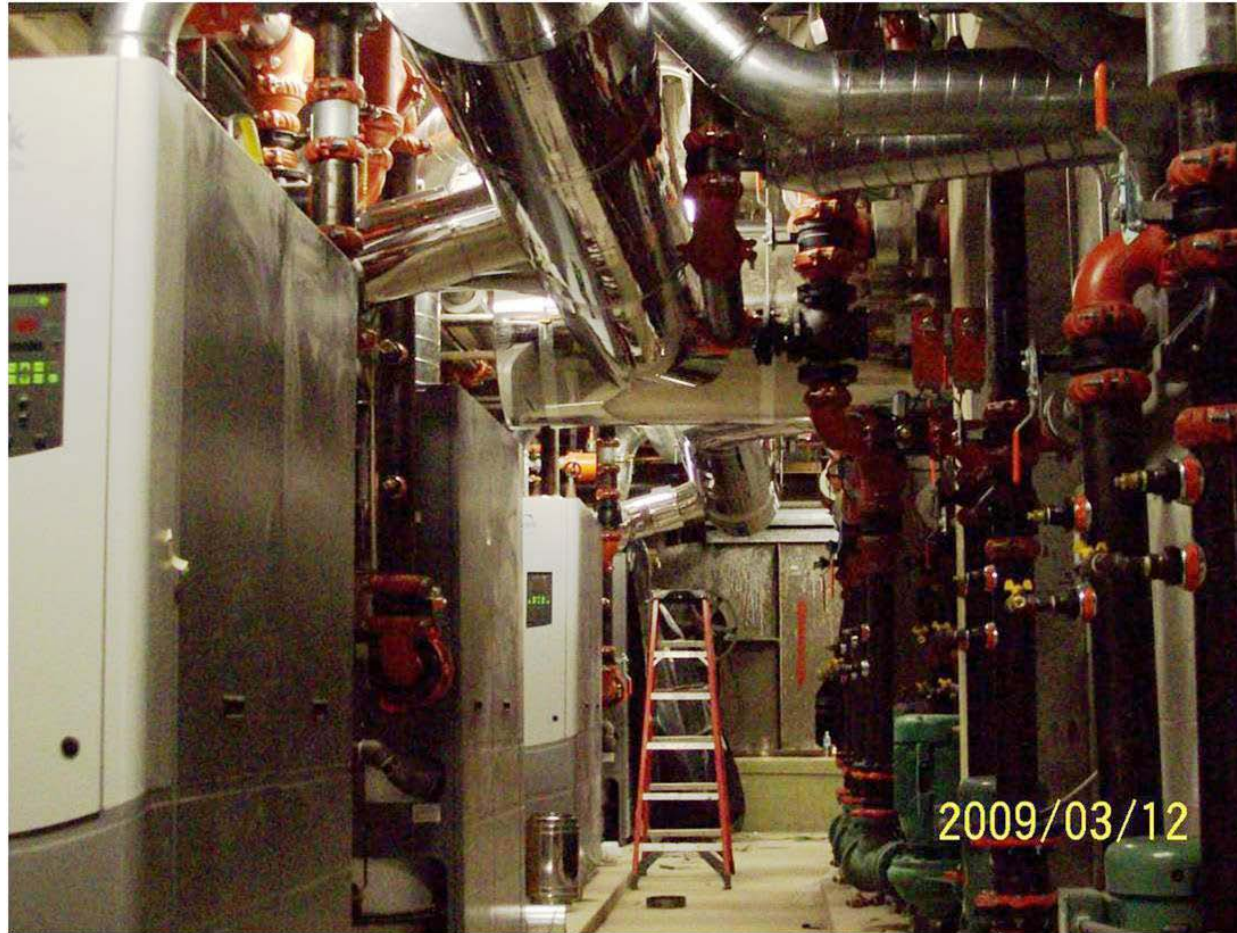
Image: New boilers in basement of Gymnasium Prospective Student Open House