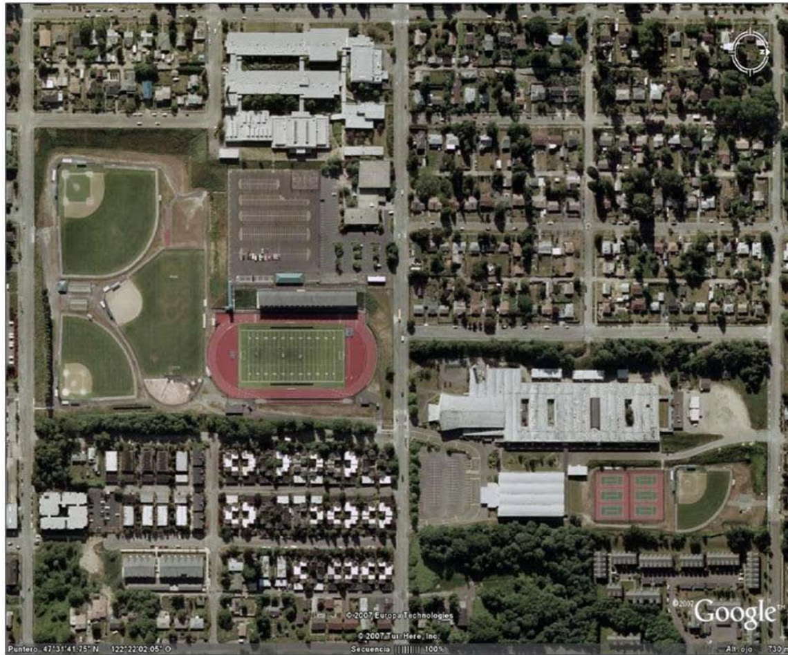
Image: Map showing location of Denny International Middle School & the Chief Sealth site before start of construction