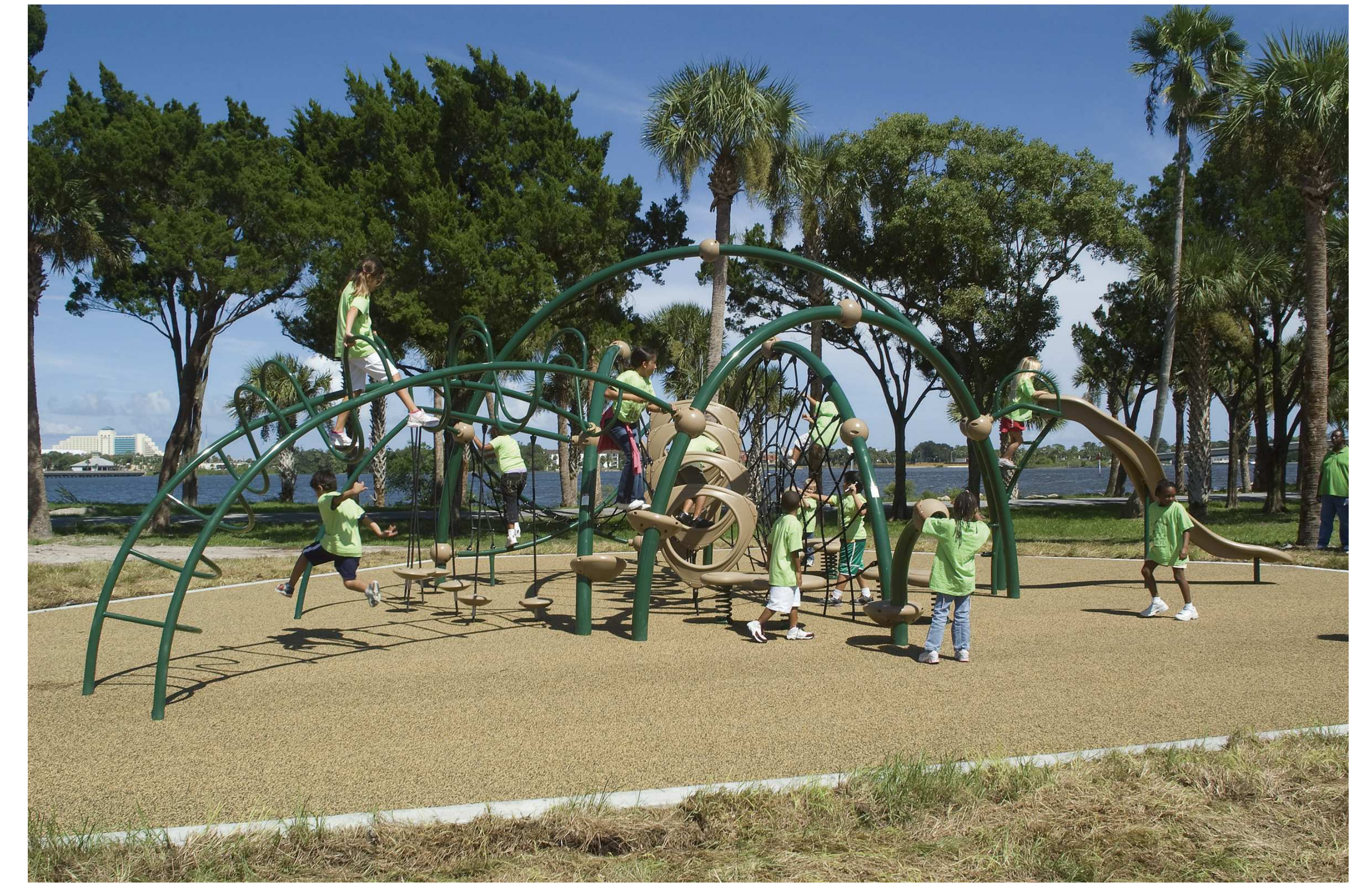
EVOS by Landscape Structures