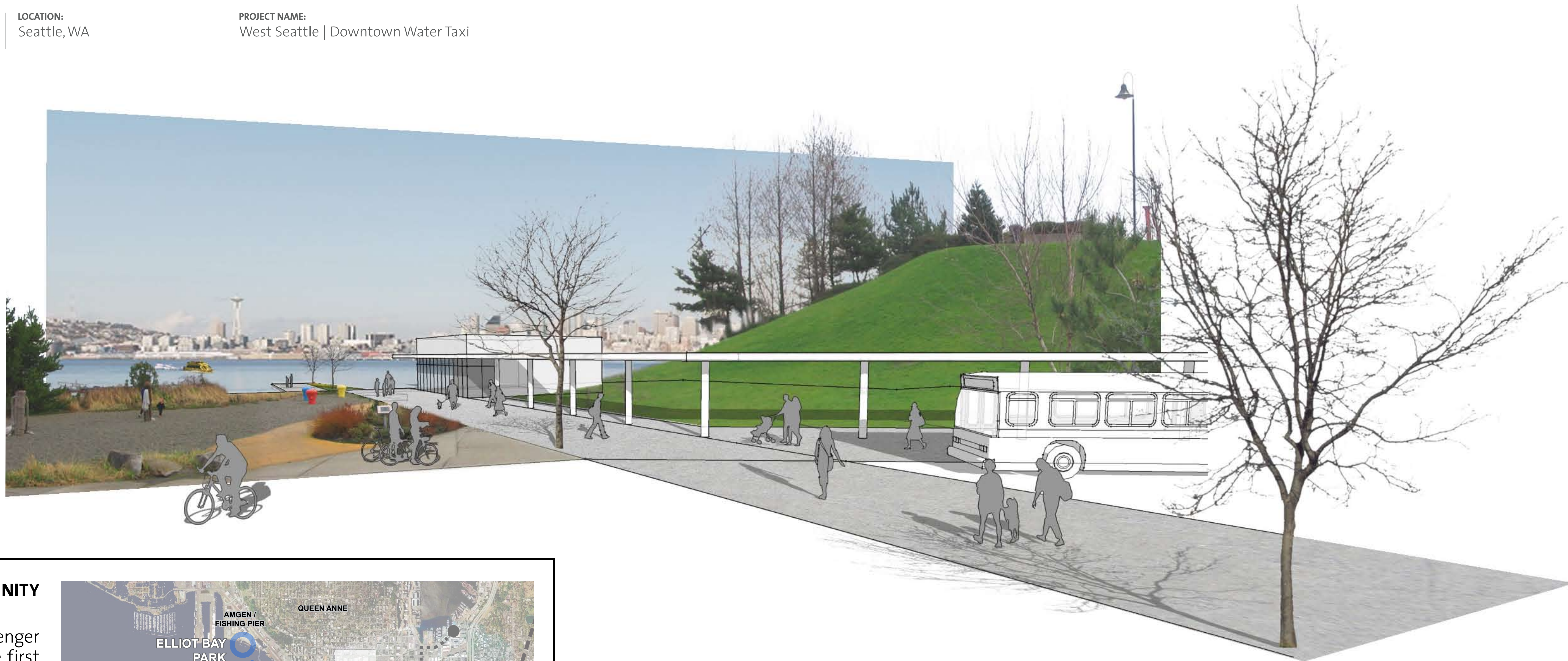
PERSPECTIVE VIEW OF PEDESTRIAN PROMENADE AND TERMINAL